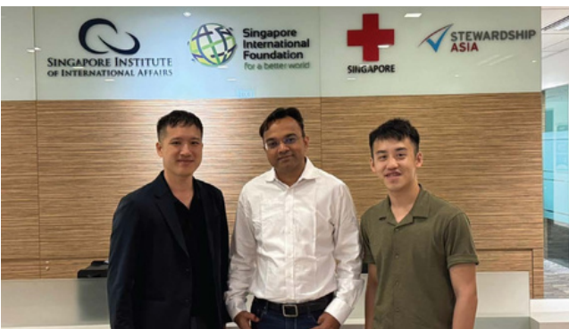
CEO's Visit to Singapore

Our CEO's visit to Singapore fostered new opportunities for international partnerships, knowledge exchange, and global collaboration. The discussions also highlighted the role of philanthropy and corporate social responsibility (CSR) in driving meaningful impact and creating sustainable change.