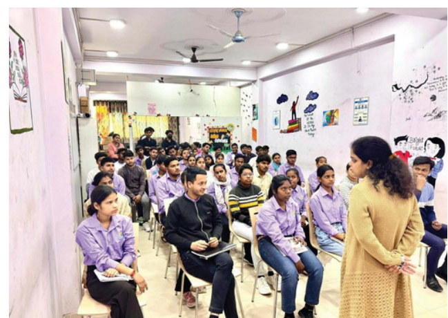
Financial Literacy session in collaboration with ICICI Foundation

We conducted a stakeholder management event in collaboration with Pratham in Vileparle and Govandi, focusing on strengthening relationships with key stakeholders like facilitators, social workers, etc.