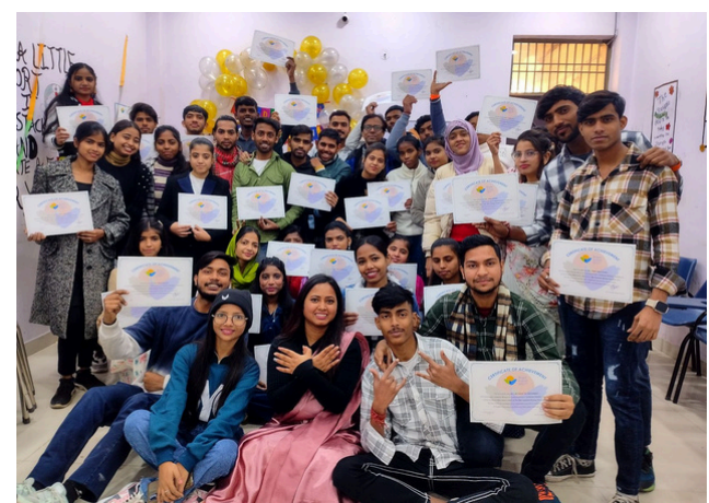
Graduation ceremony at Rohini Center, Delhi