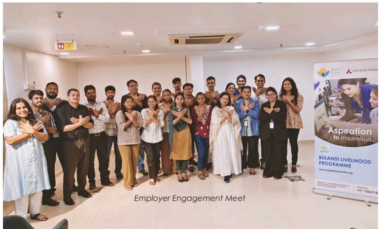
Employer Engagement Meet

At Bright Future, we believe that meaningful conversations spark change and unlock new opportunities. Samvaad, our flagship Employer Engagement Meet, unites industry leaders, volunteers, and emerging talent to drive strategic collaboration and enhance recruitment practices. Held in Mumbai, Pune, Delhi, Hyderabad, and Bengaluru, Samvaad has successfully connected employers with skilled talent, fostering sustainable employment and empowering both organizations and aspirants.