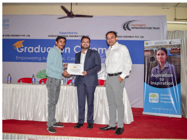
Graduation ceremony celebration at our Ghatkopar center, proudly supported by Highway Concession.

MTAR board members visited our Balanagar center in Hyderabad for the graduation ceremony, inspiring aspirants with their words of motivation. Alumni and parents shared how Bright Future has transformed their lives and opened new opportunities.