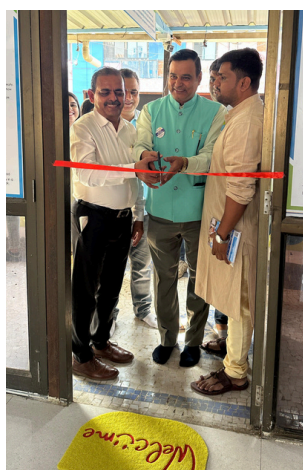
Ahmedabad center launch