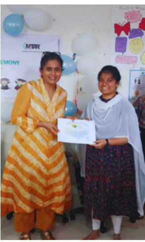
MTAR board members attended the graduation ceremony at our Balanagar center in Hyderabad.