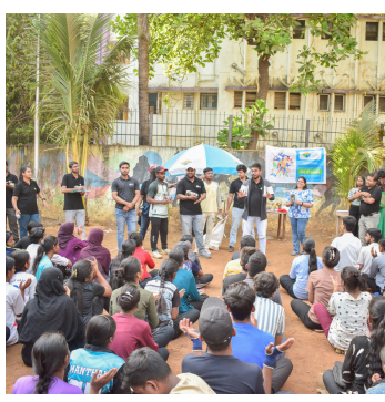
Sports day celebration