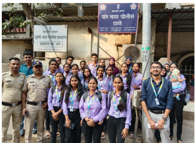
Guest Lecture by police officers in Ghatkopar and Pune